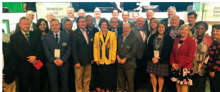
ADA 3rd District Delegation of Pennsylvania