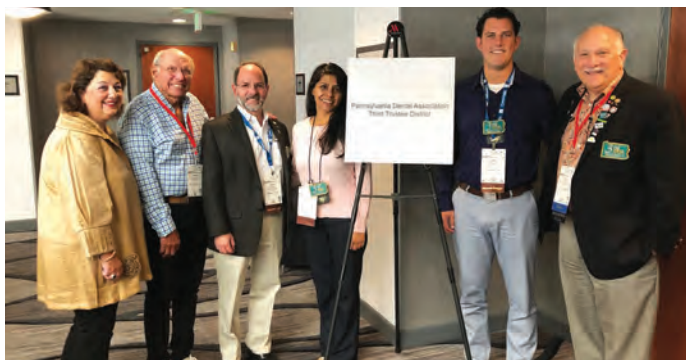
MBDS Representatives on the PDA Delegation